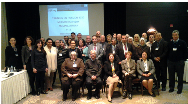
[9-11 December 2013, Amman Photo group]

Lectures and exercises with international experienced tutors were scheduled. Various outstanding and high-experienced trainers and speakers have been involved in the event to provide presentations and speeches to the participants, coming from EC-DG Research, UNIMED (Italy), CNR (Italy), CIHEAM-Bari (Italy), DLR (Germany), TUBITAK (Turkey), INCONTACT project (Greece), University of Granada (Spain) and Heliopolis University (Egypt).