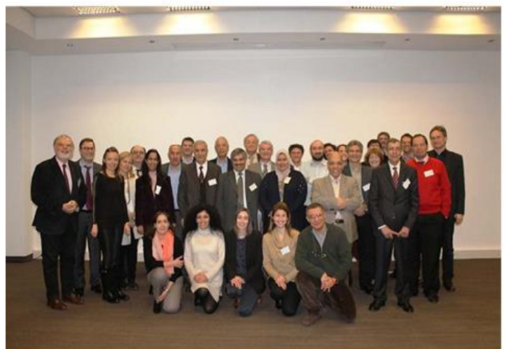
23-24 February 2015, Berlin Photo group